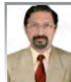
PHF Dharma A. I. 16/69, 3rd Cross Road, Simon Nagar Nagercoil 629004 Mob:98421 22026 94433 22026 jmjsurgical@gmail.com